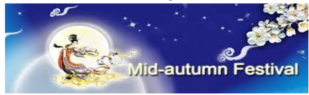
Saturday, September 26th In the hall.